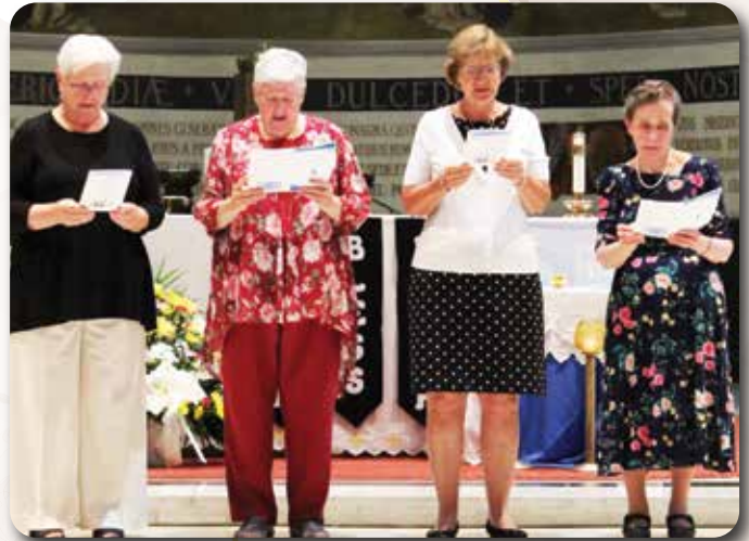
New Leadership Team