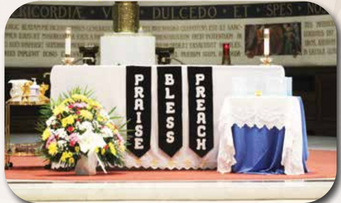
Altar, Chapel of the Most Holy Rosary

@ n Sunday, June 25th, the Sisters of St. Dominic of Blauvelt celebrated the Transfer of Leadership during a Eucharistic Liturgy at the Chapel of the Most Holy Rosary. Sisters,