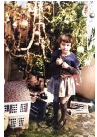
Christmas at St. Dominic's Home