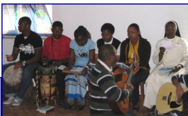
Above: Young adults from Africa and Portugal prepare for morning prayer.