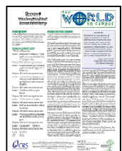
Below: The U.S. Delegation to the IDYM Assembly at Monastery Batalha.

A resource for college students that integrates Scripture and issues of justice.