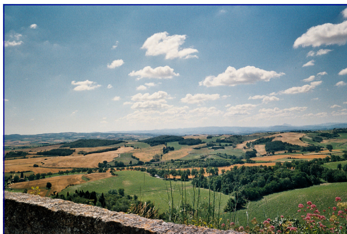
"Le Signadou," Fanjeaux, France