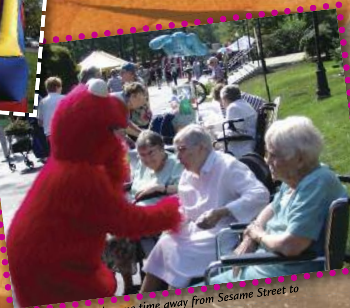
Elmo took some time away from Sesame Street to visit with some of the Sisters.