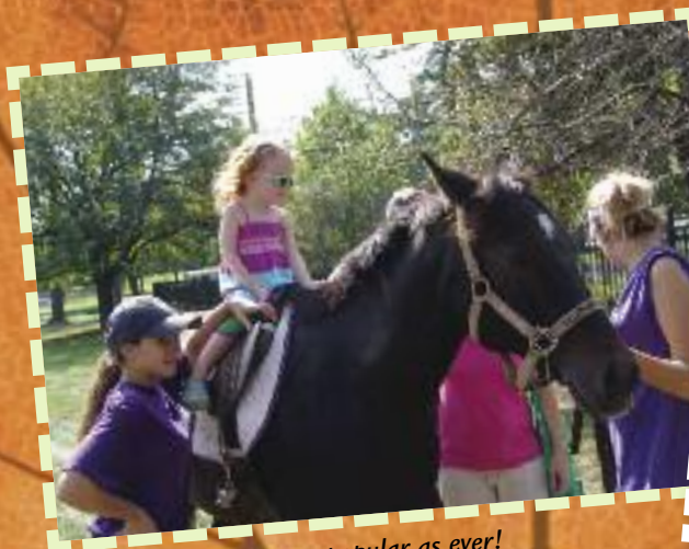
The Pony Ride was as popular as ever!