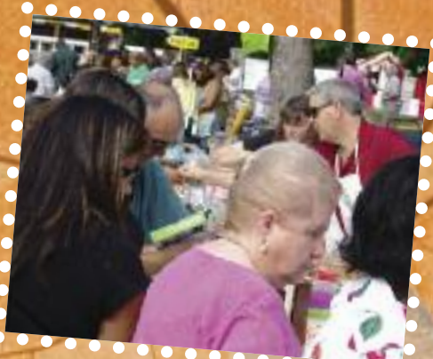
The crowd was enthusiastic about the bargains and the prizes.