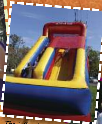
The inflatable slide attracted many adventurous children.